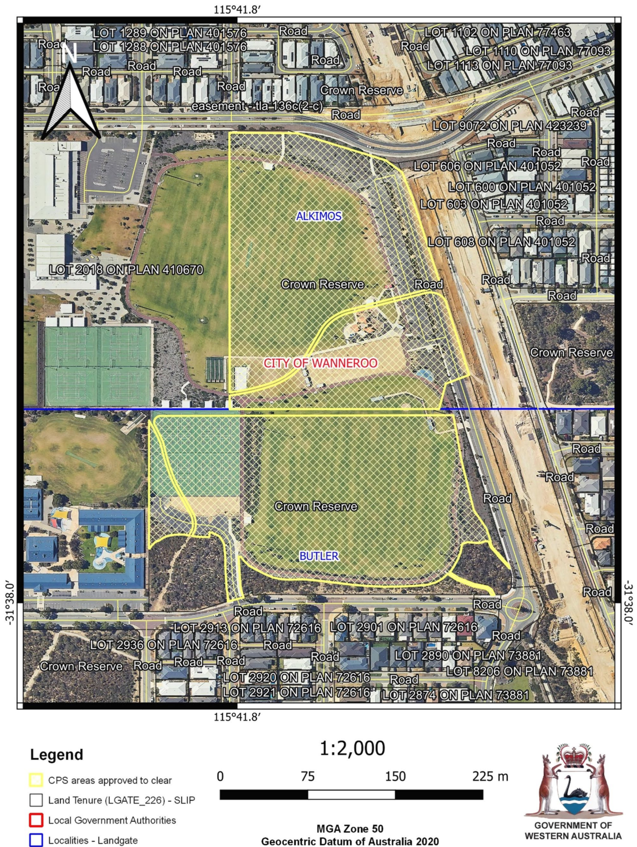
Figure 1: Map of the application area. The areas crosshatched yellow, indicate the areas authorised to be cleared under the granted clearing permit.